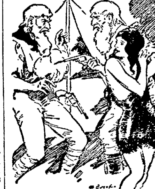
But at the Flash of the Explosion He Stopped