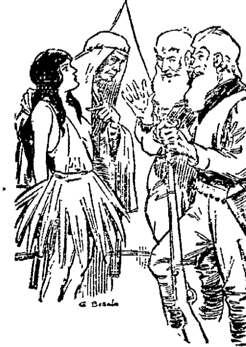
"Is She Not Both Young and Good Looking?" Asked Kovudoo.